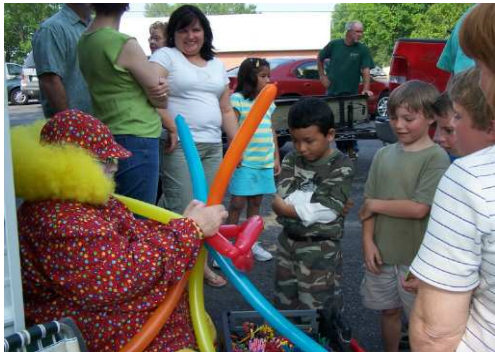
Tango the clown at last years picnic.

Is your church having a program you would like others to know about? How about a mission project you are planning? A new Bible Study or seminar or retreat? If you will submit items of interest, we will post to the bulletin board and let the rest of the community know. Remember to tell us: who, what, where, when and why. Also if there are any cost involved please let us know about those. Remember to watch the bulletin board for news you can use!